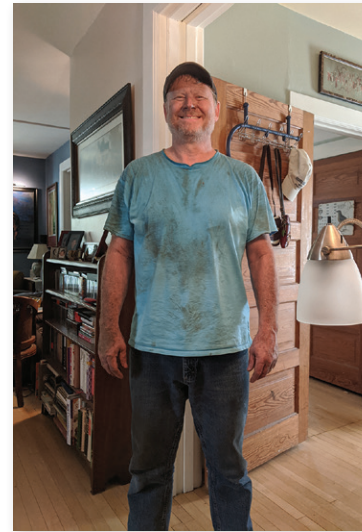
Working hard to earn that new hot tub.

Work is going well, with RTP, as a critical industry, still open, working, and I'm proud to say, taking Covid-19 very seriously.