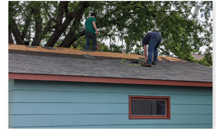
A couple of cars stopped to see if these guys were available to hire.