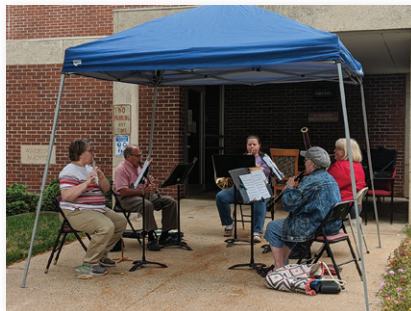
Frankly, My Dears World Premiere