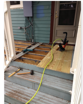
Porch repair in progress.

What with working from home since mid-March and Jack moving back for the months of May and June, 2020 has been a lot of things, but for me it was The Year of the Project, starting with: fencing the east side of the yard (Jack assist), painting the garage (Jack assist), reroofing the garage (Major Jack assist), replacing the back-porch tongue and groove flooring, building a new deck, and setting up the new hot tub, plus lots of more minor projects. At one point a neighbor down the street actually asked me if we were moving . . . because that's usually when you knock out the to-do list so well.