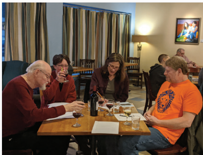
Sonnet Contest Leap Day Event