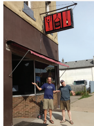
Locked out, but Island City Brewing's patio was open.