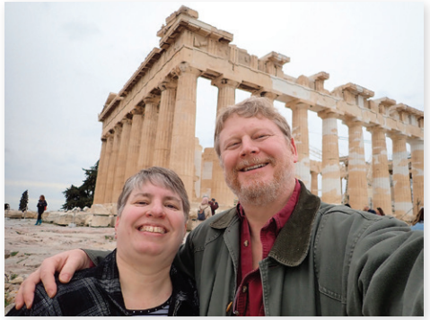
At the Acropolis