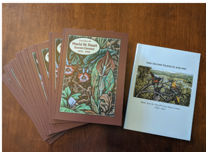
I almost forgot! I designed a book of winning Sonnet Contest entries.