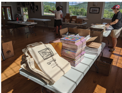
Family Art Day - the 2020 Way!