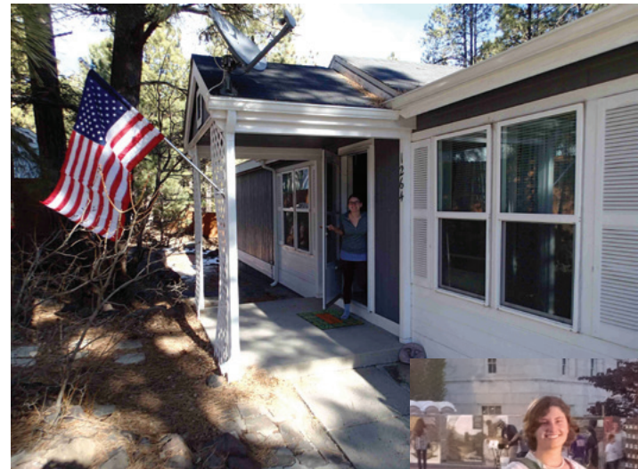
1264 S Chattanooga St Flagstaff, AZ 86001