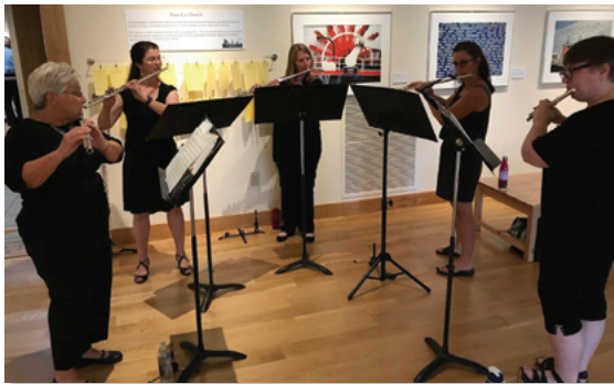
Flutistry performing for an exhibit opening at the Minnesota Marine Art Museum

Flutisty continues to be a great musical outlet. We had several performances this year, including a joint performance with other woodwind players that I coordinated called "Summer Winds". I took a chance and wrote an arrangement of "Summertime" with a bass flute solo - and people really liked it. There's not a lot of time in my schedule, but I hope to do more arranging for our group.