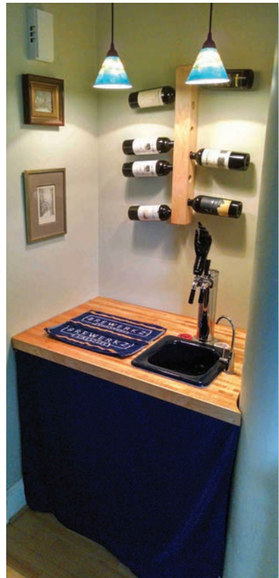
The already fabled Nederator™.