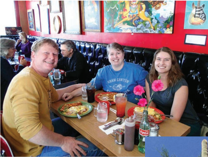
Breakfast at Martanne's in Flagstaff. Very smart.