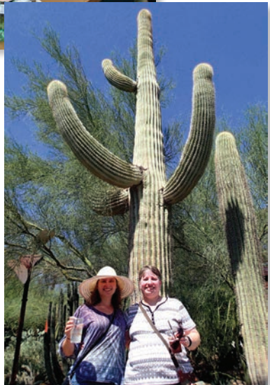
Phoenix in September. Not so smart.