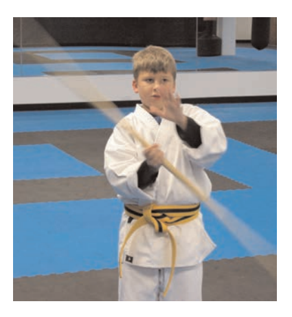
Action Shot (above) Catch of the Day (left)