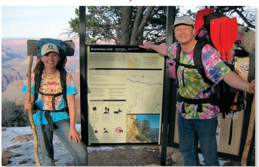
The usual suspects, 2011.

The house is pretty quiet these days, but will fill back up with music over the Christmas break. We are ready for more Jack time, but are also thrilled that he is happy at school. Life goes on.