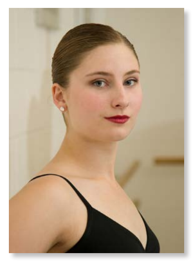
Our glamorous ballerina . . .