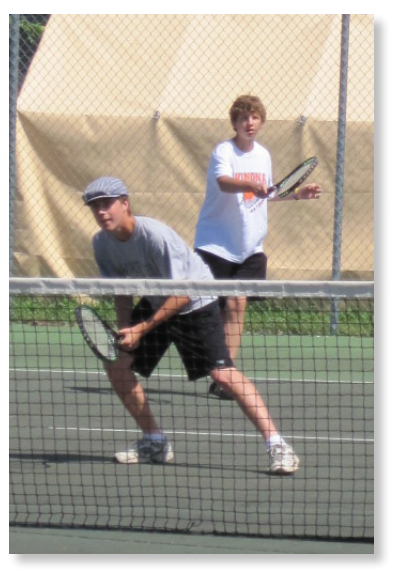
Tennis in the Summer