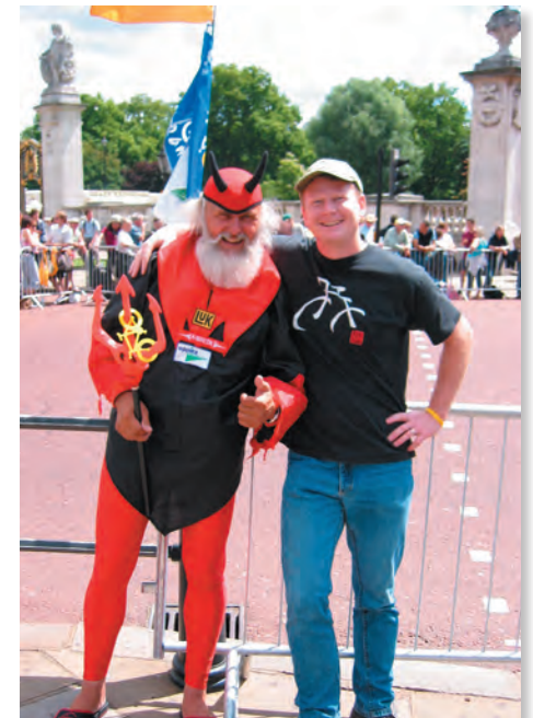
A meeting of minds at Le Tour de France

By the way, I'm now traveling to both Europe and Asia for work. One particular travel highlight was that I was able to attend the first couple of stages of the Tour de France that were held in London this year. Fantastic to be in London, in front of Buckingham Palace, with no car traffic, standing next to the Devil himself. By the way – he is one really stinky German.