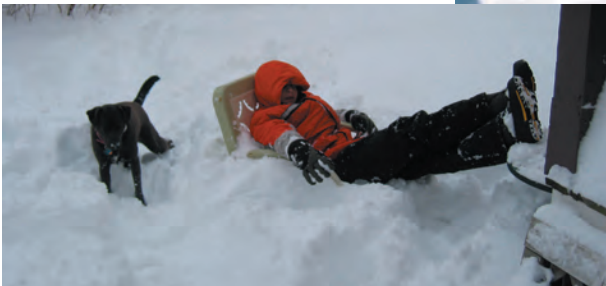
A boy and his dog- Just Chillin'