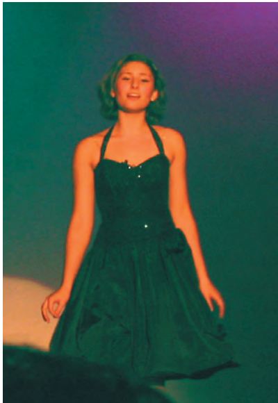
Look out! She's about to belt!