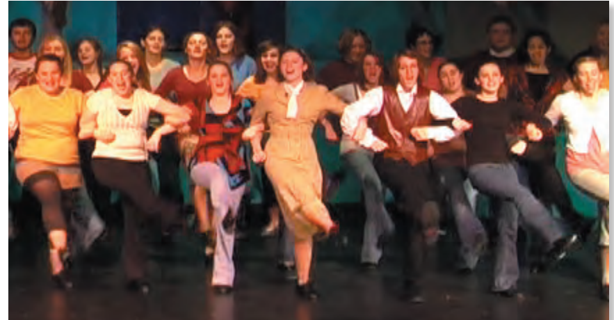
The cast of "42nd Street"