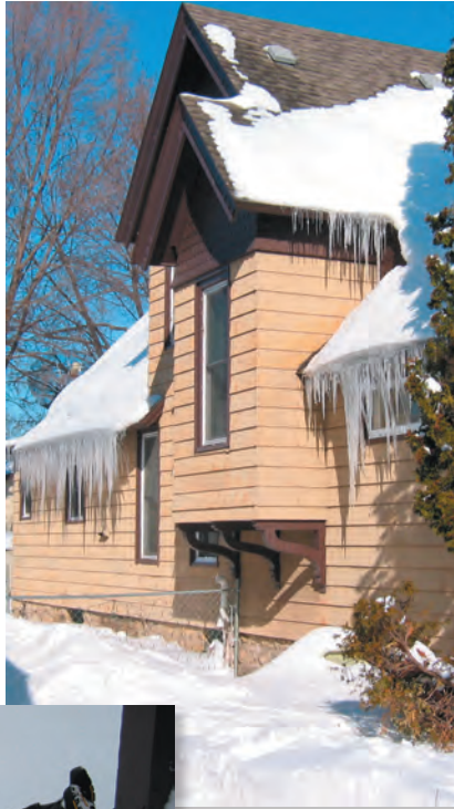
A sampling of the Storm of 2007

As we face our second winter, though, we know that spring will come and it will be awesome! For about 7 months of 2007, Minnesota was the most beautiful place on Earth. We now understand why so many people endure the brutality of continuous sub-zero weather. (It's certainly no worse than summer in Georgia!)