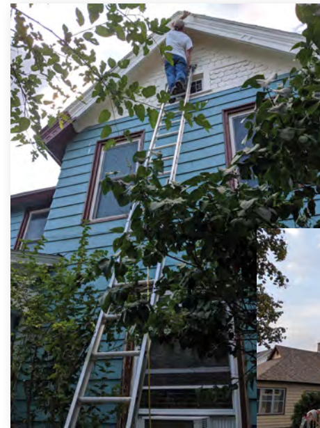
My trusty 28' ladder

And back in February, I set a new record for my 20 minute walk to work: -31°F is now the new low in Winona commuting, but who knows what this winter may bring!