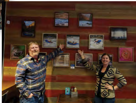
A couple of river rats on display as part of James' downtown photography exhibit.