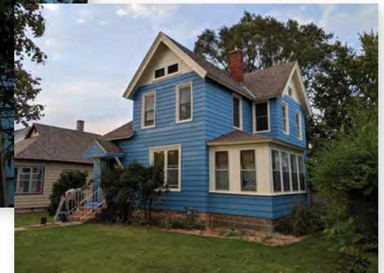
The house is very pretty now!