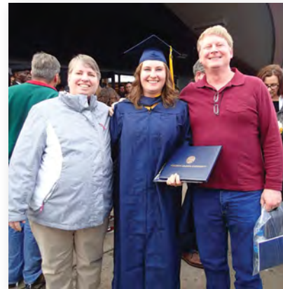
Maybe her folks were a little bit proud.