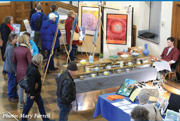
RAA Member Exhibit