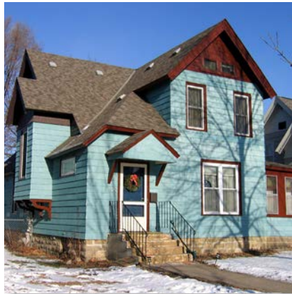
Winona House - After