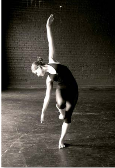
Our senior's favorite portrait