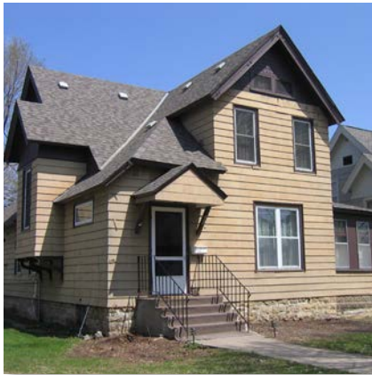
Winona House - Before

The big project of the year was an exterior paint job. Ned took a week of vacation in June to paint—then flooding rains hit the area. The project progressed over the summer and into the fall, but there will still be some trim to paint in the spring. Though Heidi has helped with the main level trim, she's not willing to climb the 28' ladder to help up high. So it's mostly been Ned's tireless efforts that have led to the transformation you see below.