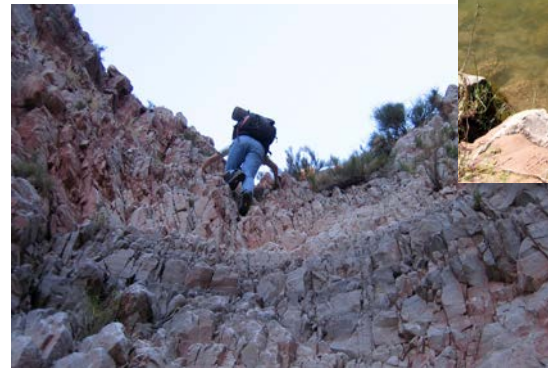
Maddy climbing up the trail in Cranberry Canyon

I am very happy to report that after two and a half years I have still either walked or pedaled to and from work virtually every day, only driving when I needed a car for some other reason during or immediately after work. Unfortunately, and in stark contrast to last year, we had a long, cold, dark and snowy winter...Brrr!