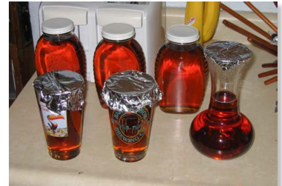
A lot more maple syrup than expected

For those of you that remember this story from last year the quote was "Hopefully we'll make enough for at least one breakfast..." Well this now needs to be reported as one of the biggest successes of 2008. In the middle of March, Jack and I drilled holes in the tree and sap started dripping before we could even get the taps in. The sap was sweet to the taste and it ran and ran for a couple of weeks, at times nearly overwhelming our ability to keep up by boiling it down. We ended up running out of proper containers to put it in and during the finishing process we had to press some pint glasses into service. Final production was over a gallon of delicious maple syrup. And for those of you concerned about the tree, by June the holes were completely grown over and filled in. We can't wait to try this again in a few months.