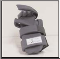
Eclipse Finger Flex