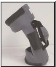
Eclipse Flex Knee