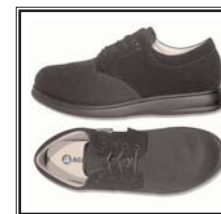
Comfort Street Shoe