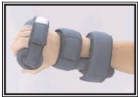
Felix II Grip